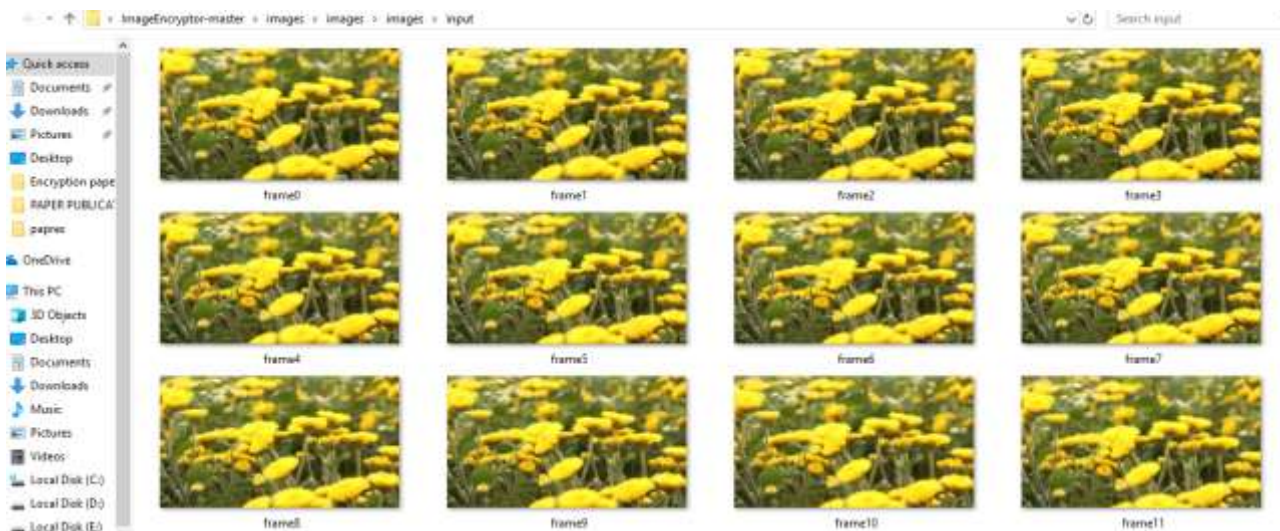
Fig 2: Original images

The output of the video encryption and decryption is shown below. Here the video is converted into frames and it is encrypted and then decrypted as shown in the figure below.