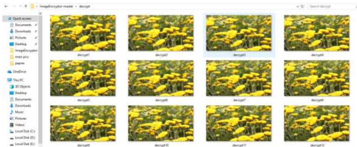
Fig 4: Decrypted images