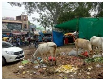
Fig-1 Primary survey

There is no proper area which is defined for dumping the garbage. People often dump garbage in front of their shops on the streets. Every morning an GMC truck comes and to collect all the garbage on the streets. The dumping of garbage on the streets creates a very unhygienic condition for the people living.