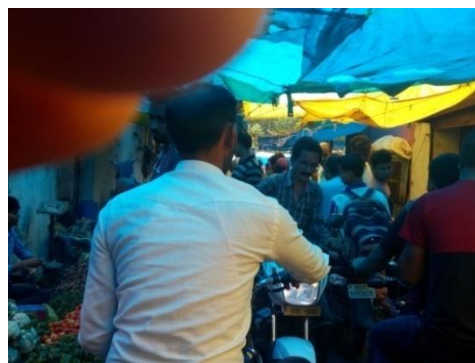
Fig-2 Primary survey