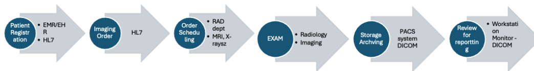
Figure 2 Flow of Data using HL7 in DICOM protocol

SOA also supports the adoption of standards for medical imaging, such as the Digital Imaging and Communications in Medicine (DICOM) protocol. Imaging systems are a critical component of modern healthcare, and their ability to integrate with other healthcare systems is essential for comprehensive patient care. SOA ensures that imaging data can be securely shared and interpreted across platforms without loss of fidelity or context. This capability is particularly important in scenarios such as telemedicine, where clinicians may need to access high-quality diagnostic images remotely to provide timely care.