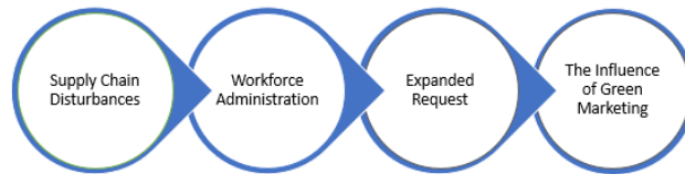
Figure1: Crisis Reaction & Coordination Challenges in the utility Sector 2020

the utility division. One of the most eminent challenges is the sudden move to further operations. Numerous utilities were constrained to actualize inaccessible working arrangements for non-essential staff, which expanded the weight on field operations and influenced the effectiveness of coordination and upkeep services.