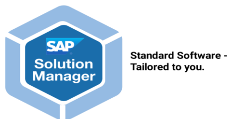
Figure 1: Featuring SAP Solution Manager

SAP Solution Manager, often referred to as (SolMan) can be considered to be a practical tool that is accordingly utilised with the purpose of implementing maintenance and integrating different SAP systems alongside the process of troubleshooting any pre-existing issues. The maintenance of proper data configuration in terms of Managed System Configuration (MSC), project and process management along with ChaRM can result in ensuring proper data security, system integrity and readiness of the audits. It further assists different business entities regarding risk mitigation processes and streamlining the associated business operations. Owing to these reasons, the SAP Solution Manager holds paramount importance in any organisational entity for accordingly complying with the business processes.