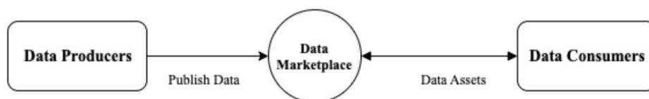
Figure 2: Data marketplace

The concept of a data marketplace is rooted in the growing demand for accessible and high-quality data. As businesses increasingly rely on data-driven insights to inform their strategies, the need for a reliable and efficient way to acquire data has become paramount [7], [13], [15]. Data marketplaces address this need by creating a digital ecosystem where data can be easily bought and sold, much like a stock market for data. This approach not only simplifies the data acquisition process but also promotes data reuse and innovation.