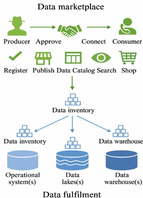
Figure 4: End to End data marketplace architecture

Historically, data exchange has been a complex and often cumbersome process. Traditional methods of data sharing typically involved direct negotiations between data providers and consumers. This could mean sending data via physical media like CDs or USB drives, or through secure file transfer protocols (SFTP) for digital exchanges [7]. In many cases, data was shared under strict non-disclosure agreements (NDAs) to protect sensitive information.