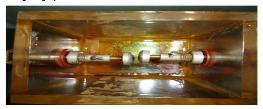
Figure .3 Oil test cup

At the room temperature, by using oil test cup the sample's breakdown voltage were measured with specified standard (IEC 60156). Fig3 shows that the oil test cup. The oil testing cup has set up transformer capable of giving upto 60 kv.