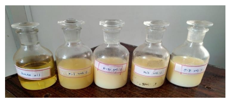
Figure .2 Preparation of samples

E-ISSN: 2582-2160 • Website: <a href="www.ijfmr.com">www.ijfmr.com</a> • Email: editor@ijfmr.com