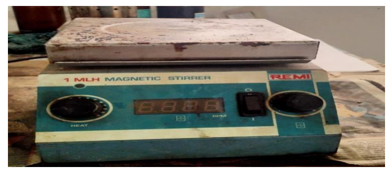
Figure. 1 magnetic stirrer setup

In our review ,the Cuo nanoparticles were included in a vegetable oil(CSO) to create the nanofluids. The Cuo nanofluids were arranged utilizing underneath referenced cycle with different volume focuses from 0.1 to 0.4%.