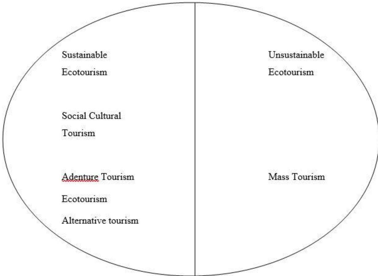
Figure-1 Conceptual model of Tourism (Eriksson, 2003)

Difference between Mass Tourism and Ecotourism are shown below in Table-1