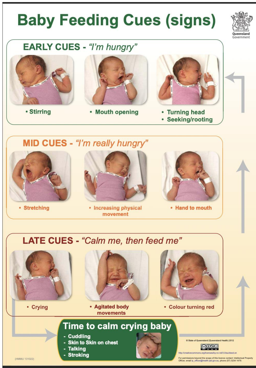
Fig-1: Baby Feeding cues