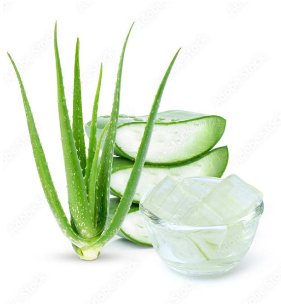
Fig No 5. Aloe vera

conventional medicine. You can also utilize the leaves straight out of the package by breaking them apart and extracting the gel.