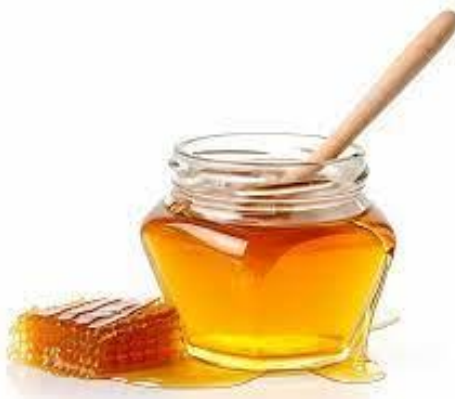
Fig No 6. Honey

Additionally, honey's anti-inflammatory qualities can help with skin disorders like psoriasis and acne. Honey is really good for your skin because it helps keep it moisturized. The special stuff in honey lets it go deep into your skin and make sure all the layers stay hydrated. That's why your skin ends up looking smoother and softer, with a nice glow.