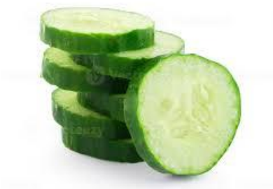
Fig No 7. Cucumber

Cucumber helps with excessive oils, dryness, and blocked and noticeably enlarged pores because it is packed with vital nutrients, minerals, and antioxidants. Furthermore, its high water content increases skin hydration levels, resulting in a naturally radiant complexion. It lessens the presence of black spots. Cucumber efficiently treats dark spots with its astringent, brightening, and cooling effects. Additionally, it increases the skin's collagen levels, which aids in cell renewal.