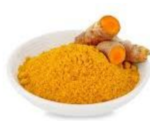
Fig No 3. Turmeric