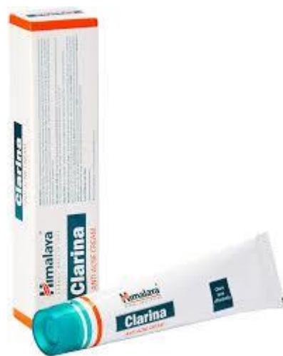
Fig No 2. Acne Cream

In the quest for radiant skin, herbal acne creams emerge as steadfast allies, bridging the gap between nature and science with wisdom passed down through generations. With their gentle yet powerful formulations, they offer a beacon of hope to those navigating the tumultuous seas of skincare. So, embrace the healing touch of nature and embark on a journey towards clearer, healthier skin with herbal acne creams as your trusted companions.