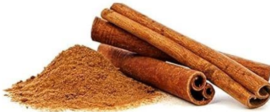
Fig No 4. Cinnamon

The source of cinnamon bark and leaf oils, is an indigenous tree of Sri Lanka, although most oil now comes from cultivated areas. C. zeylanicum is an important spice and aromatic crop having wide applications in flavoring, perfumery, beverages, and medicines.