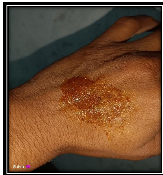
Fig No 9. Irritability test

It was evaluated by patch test. It is not verified test but as per mentioned on marketed preparations label, had performed this test also. Little quantity of the cream was applied on the surface of skin and kept it as it is for few minutes.