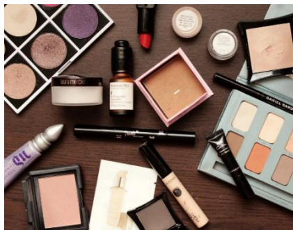
Fig No 1. Cosmetic product

Skin is one of the largest organs of the body. Skin functions as a protective wrapper, keeping everything beneath it safe from daily threats such as the harsh effects of sun, wind and pollution, germ filled grime. Skin is also a sensory organ, which indicates the health of an individual. Skin care is very important to make it healthy and fresh; there are so many market preparations for skin care. Skin care is at the interface of cosmetics and dermatology but skin care differs from dermatology, it does not require any medical professional every time. Cosmeceuticals are the future generations of skin care. The term cosmetic derived from Greek word 'Kosmeticos' which mean pertaining to cosmetics or beautifying substance or preparation. The word 'cosmesis' (Gr. Kosmesia) used for two things: the preservation restoration or bestowing of body beauty, the surgical correction of disfigured physical effect. Cosmetics are defined as the products used for the purposes of cleansing, beautifying, promoting attractiveness or alternating the appearance.