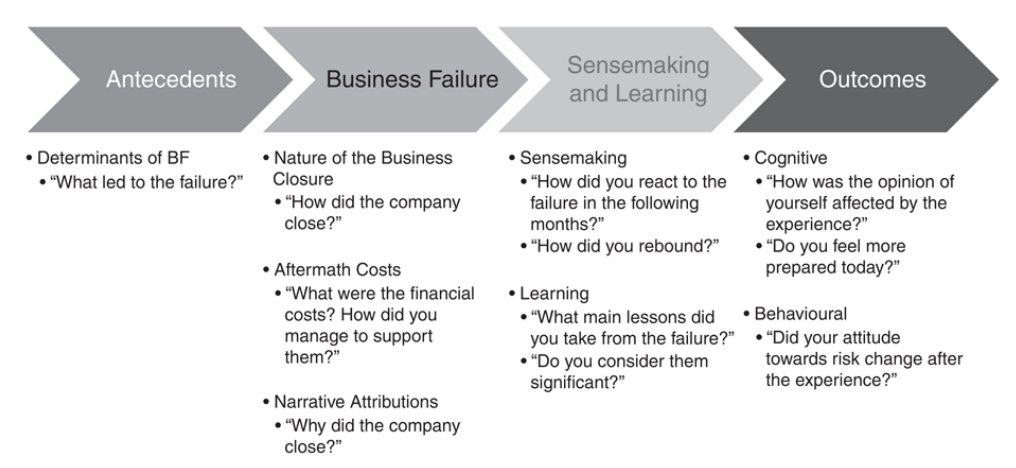
FIGURE 1- BUSINESS FAILURE MODEL

For instance, the pandemic has exponentially increased the number of financially troubled businesses in European countries. About "half a million firms are at risk of collapse," according to estimates. Widespread economic hardship has resulted from this, with potential long-term effects on the world economy.