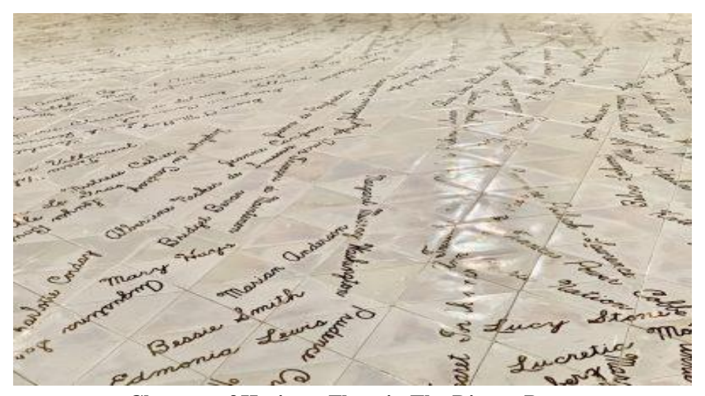
Close-up of Heritage Floor in The Dinner Party

(https://www.nastywomenwriters.com/feminist-artist-judy-chicagos-the-dinner-party-celebrating-women-across-time/)