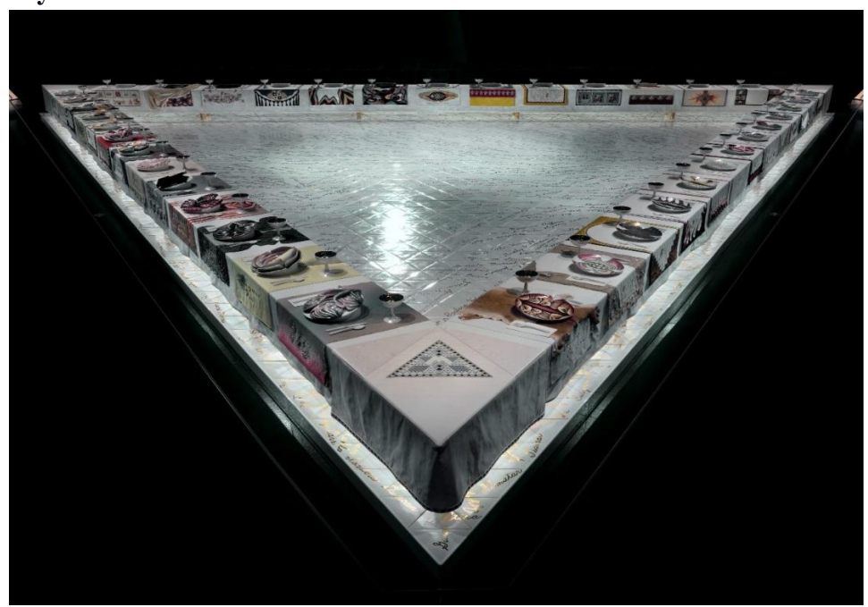
Judy Chicago, The Dinner Party, 1974–79, ceramic, porcelain, and textile, 1463 x 1463 cm