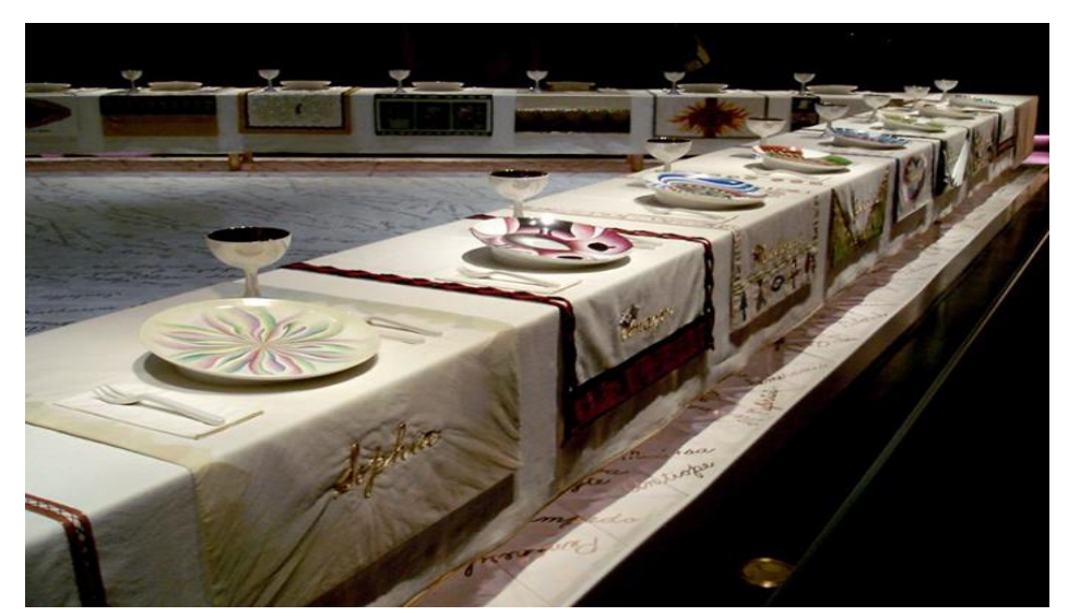
Judy Chicago, The Dinner Party, 1974–79, ceramic, porcelain, and textile, 1463 x 1463 cm

The Dinner Party is an installation work of feminism. Judy is regarded as the first epic feminist work of art. It serves as a symbolic history of women in civilization. The triangular table features 39 ornate place settings, each representing a different renowned and historically significant woman. A hand-painted china plate, ceramic flatware, and a gold-embroidered napkin make up each place setting. Except for Sojourner Truth and Ethel Smythe, each plate features a colorful, ornately stylized representation of the female genitalia. Places are put atop runners decorated with needlework of varying styles and methods. The table stands on The Heritage Floor, which comprises more than 2,000 white glitter-glazed triangular tiles, each inscribed in gold script with the name of one of the 998 women and one man who left their mark on history. (The correct spelling of this name is KRESILAS. Casillas, a Greek sculptor active in the fifth century BC, was a man and was mistakenly included in The Dinner Party) (Cresilla).