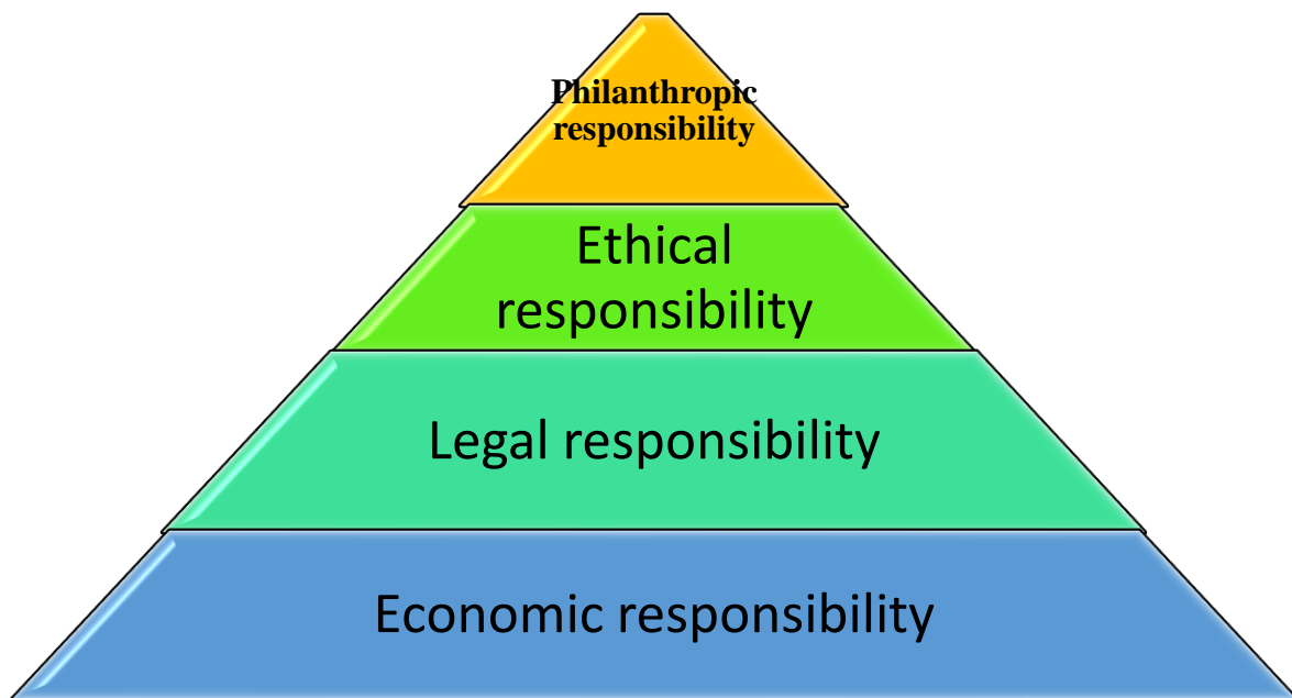
CAROLL'S MODEL Figure:1 cited by author.