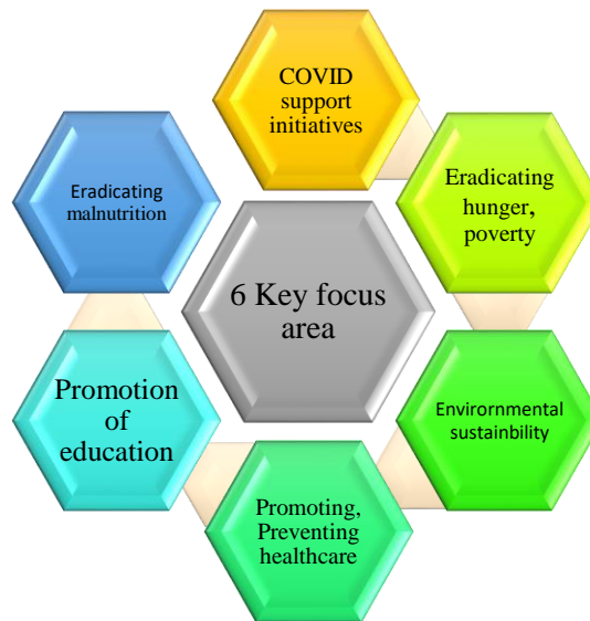
(Figure 2 cited by author)

is dedicated to improving the areas in which we source, reside, work, and market our products. The Dabur India Limited has various CSR programs or policies and those are encouraging and preventing medical malpractice, guaranteeing ecological sustainability, and eliminating starvation, destitution, and inadequate nutrition, promotion of education, women empowerment and promotion of sports.