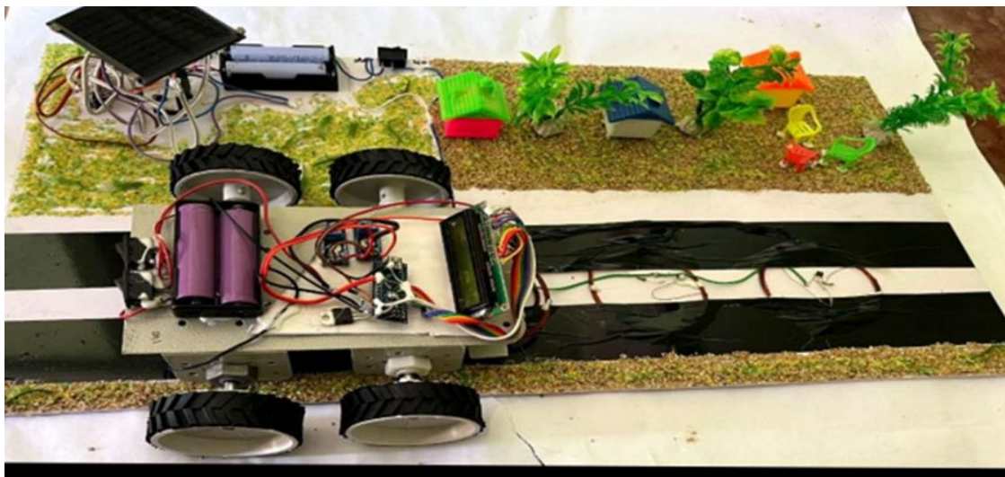
Figure 2: Overall image of the project

As shown in Table 2, the system's power consumption is analysed for different components. The system integrates a solar panel, battery, transformer, voltage regulator circuitry, copper coils, an AC-to-DC converter, an ATmega microcontroller, and an LCD display to facilitate wireless charging. This setup demonstrates how electric vehicles can be charged while in motion, eliminating the need for stationary charging stops [15]. The solar panel supplies power to the battery through a charge controller, ensuring efficient energy management. The battery stores direct current (DC) power, which must be converted into alternating current (AC) for wireless transmission. To achieve this conversion, a transformer is utilized.