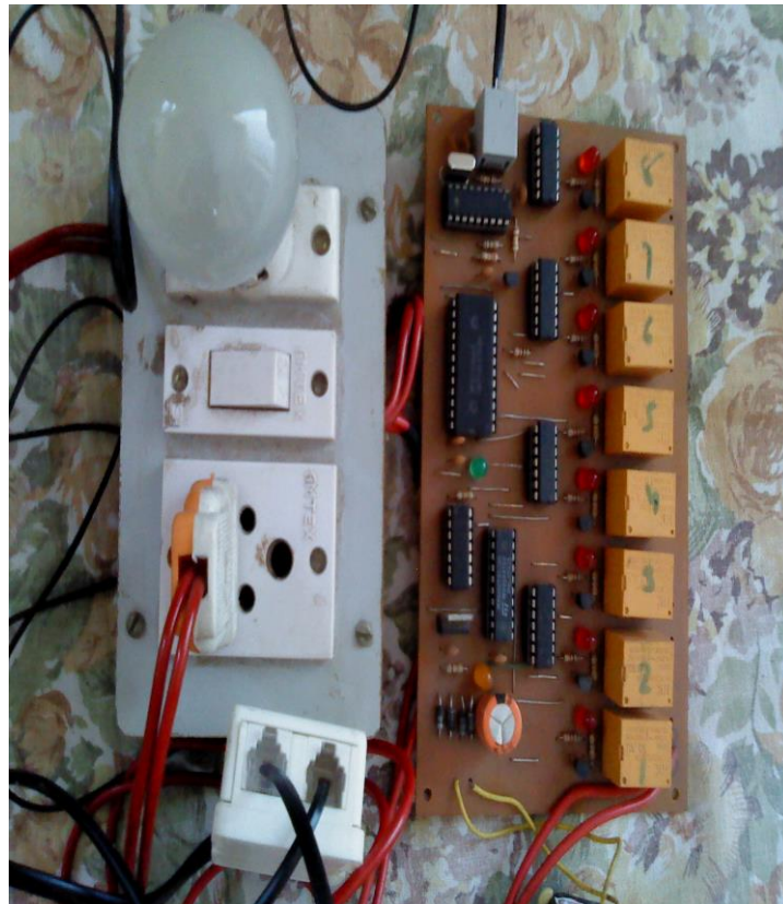
Fig final circuit diagram of link control

This thesis describes an architecting method for embedded systems. Examples of embedded systems are cell phones, televisions, MRI scanners and wafer steppers. Embedded systems are systems where the computer and the accompanying software are built-in. Moreover, embedded systems are full of other technologies that are needed to perform the function in the physical world. Examples are transmission and reception technologies, display technology, optics and all kind of mechanics to position.