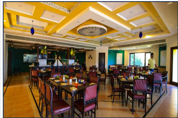
Elegantly appointed interior of a restaurant, featuring a vibrant colour scheme, ornate ceiling details, and numerous tables set for diners.