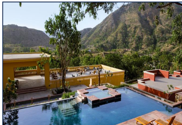
Inviting swimming pool, a spacious patio with seating areas, and stunning views of the surrounding landscape.