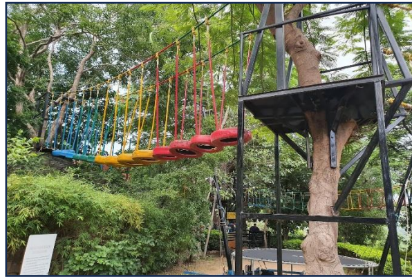
A colourful, playful outdoor obstacle course is built among lush green trees, featuring suspended tire swings and rope bridges.