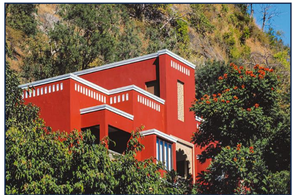
Organized, Symmetrical Design Like a Structured Hallway or Apartment Block