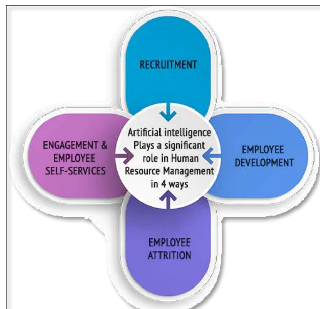
Figure 2: Benefits of AI in Human Resource Management

Artificial Intelligence offers a range of significant benefits to Human Resource Management, fundamentally transforming how organizations make decisions and engage with employees. One of the primary advantages of AI is its ability to enhance decision-making by providing real-time insights derived from vast and complex datasets. Unlike traditional methods that rely on periodic reporting or intuition, AI systems continuously analyse diverse data points such as employee performance metrics, engagement surveys, and market trends, enabling HR professionals to make more informed and timely decisions. This data-driven approach helps organizations anticipate workforce needs, optimize talent allocation, and identify emerging issues before they escalate.