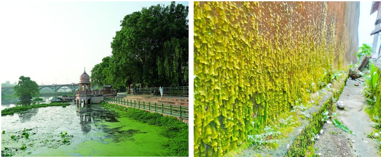
Figure 1. Lower botanical habitats in Lucknow showing algal growth along the Gomti River and bryophyte colonization on shaded urban surfaces.