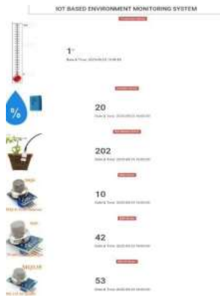
Fig 4.website view