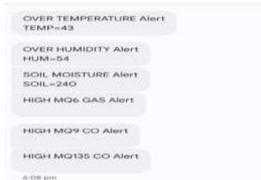
Fig 5. SMS Alert

The hardware model integrates multiple IoT sensors such as MQ135, MQ9, LM35, and a soil moisture sensor. These sensors are connected to an Arduino UNO, which acts as the main controller. The Arduino collects the data, processes it, and transmits it via the GPRS module to the cloud platform. An LED display provides on-site monitoring, while an SMS alert system ensures immediate notifications of abnormal conditions.