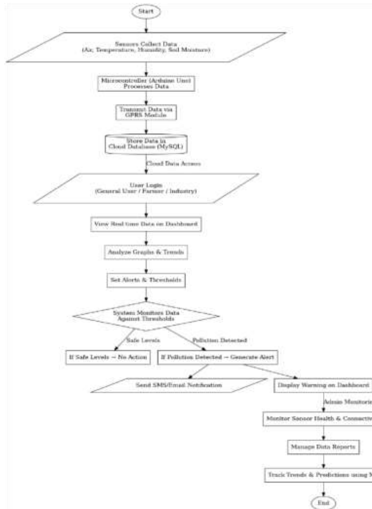
Fig. 3: Flowchart of Working Principle