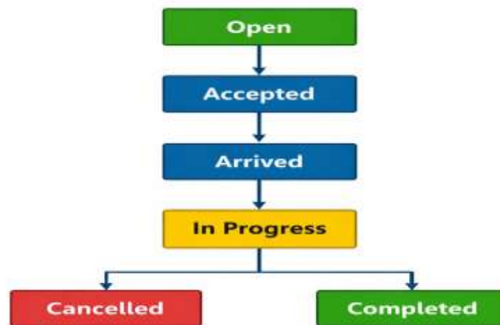
Figure 1: Job Lifecycle