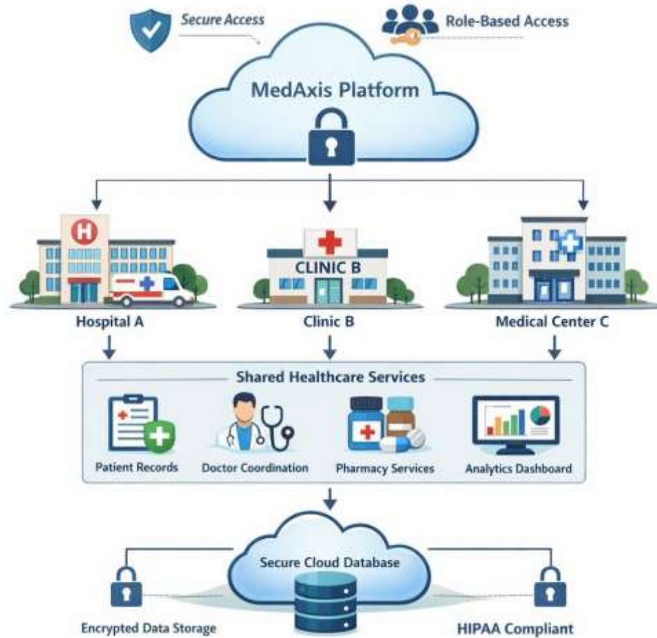
Fig 4. Cloud-Based Healthcare Data Model

The data model organizes healthcare information into structured entities including patients, doctors, appointments, prescriptions, and billing records. These entities are linked through relational structures that allow efficient data retrieval and reporting.