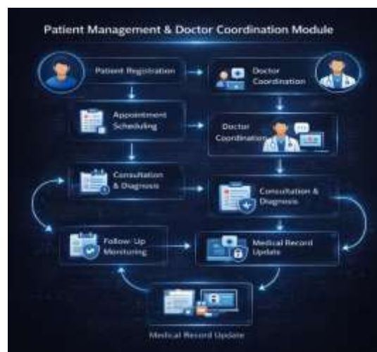
Fig 5. Integrated Healthcare Workflow Management.

The MedAxis platform addresses this challenge by connecting prescription management and pharmacy services directly with the patient’s digital health record. When a doctor completes a consultation and prescribes medication, the information can be securely stored and made available to authorized pharmacy systems within the same platform environment. This integration reduces paperwork and improves the accuracy of prescription handling.