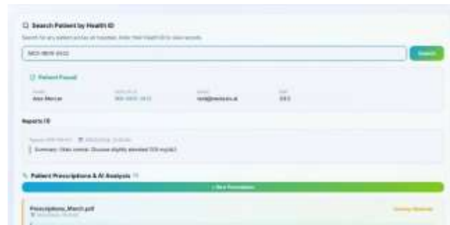
Fig 2. Patient and Doctor Coordination Interface

Patients can be registered in the system with basic personal and medical information, while doctors can access relevant patient data during consultations. This centralized approach reduces the fragmentation of medical records and improves communication between healthcare professionals.