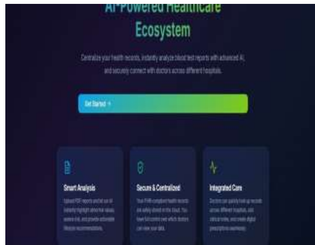
Fig 1. MedAxis Healthcare Platform Architecture. Formulae:

Within this architecture, the platform connects patient management, doctor coordination, and pharmacy operations into a single integrated system. Each healthcare facility can maintain its own patient records, staff information, and operational workflows while ensuring data privacy between different providers. For each healthcare organization using the system, patient data, doctor schedules, and treatment information are organized through structured digital records. This allows healthcare providers to track patient interactions, manage appointments, and maintain consistent documentation across departments.