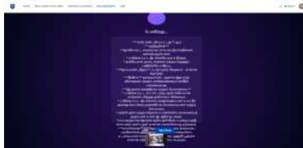
Figure 4 AI Voice Assistant