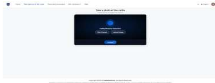
Figure 1 Initial Data Analysis & Upload

Figure 4: AI Voice Assistant: A screenshot of the chat interface with the "Play Audio" button active, representing the ElevenLabs integration.