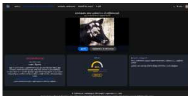
Figure 2 Multimodal Result