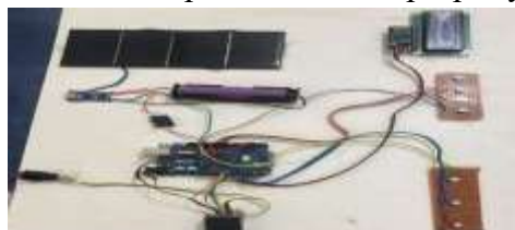
Fig. Experimental setup of the biometric electronic voting machine using Arduino UNO

The system was also tested to respond to the sensors correctly, stable power supply and proper wiring connection before conducting final tests. To test the accuracy of the system, it was under test conditions of simulated voting after all modules could be proved to work properly.