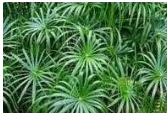
Fig.1 Umbrella sedge

The Umbrella sedge Grass comes from the bracts that grow atop of its tall stems. They have the appearance of the spokes of an umbrella. The bracts are sometimes referred to as leaves. The true leaves on this plant clasp the tall stem in a manner so that they are hard to distinguish from the stem. The Umbrella sedge Plant is a member of a large family of plants, with over 600 grass-like varieties, typically native to predominately tropical locations. Its root system is well-developed, anchoring the plant into the surrounding wet soil where it can spread via its rhizomes as well as by its self-seeding tendencies. In some locations, with the right conditions, it can become weedy and invasive. Typically reaching heights of 4', under ideal outdoor conditions of a warm, moist environment, they can grow up to 6'.