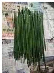
Fig.2 Stalk of Umbrella sedge

Chemical retting uses chemical solutions, like acids or alkalis, to dissolve the pectin and other non-cellulosic materials that bind natural fibers (such as flax, hemp, and jute) to the plant stem. This process is a faster, though more expensive, alternative to microbial retting, yielding clean and high-quality fibers in a matter of hours instead of days or weeks. However, it generates polluted wastewater and can reduce the fibers' tensile strength if harsh chemicals are used at high concentrations.