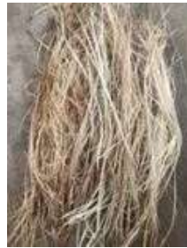
Fig.3 Water retted fibre