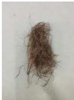
Fig.3 Chemical retted fibre

In a chemical retting process, "manual scraping" refers to a post-chemical treatment action where workers physically scrape the plant material to remove the softened, non-fibrous components and expose the raw fibers. After chemicals have softened and dissolved the fibrous matrix, scraping tools like knives or specialized implements are used to scrape away the now-brittle woody parts, a process also known as scutching, leaving the desired fibers clean for further processing.