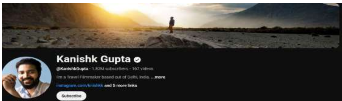
Figure 1 YouTube profile of creator Kanishk Gupta

The qualitative content analysis method is used in this study to analyse the content of travel documentaries created by the chosen YouTube creators. Qualitative analysis is indeed appropriate in the context of media research because it can enable the researcher to read narrative patterns, visual narration and cultural images that exist within audiovisual media.