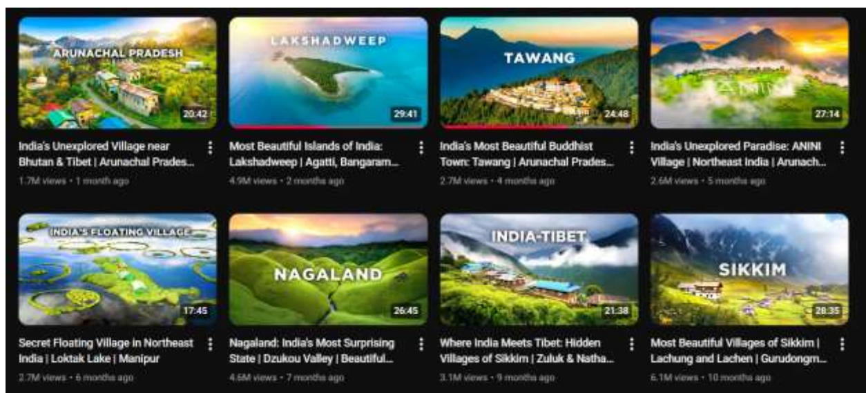
Figure 2 Covering different cultures, regions, and society

About thirty videos on these channels were evaluated. The videos were analysed in terms of style of narration, visual style, cultural topics, and viewer interaction. Special care was taken in terms of the depiction of creators on the art forms, festivals, food traditions and the rural way of life. Kanishka Gupta is one of the youngest creators of travel documentaries to be mentioned in the list of the most popular products on YouTube. The channel has a large following of over 1.82 million subscribers and over one hundred videos, and this shows that the channel has a strong audience base, which is interested in exploring different cultures and tourists seeking knowledge about it.