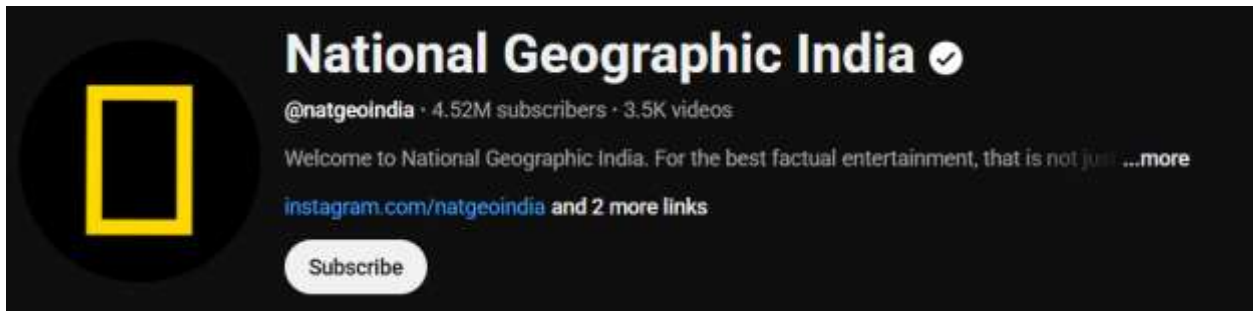
Figure 3 YouTube Profile of National Geographic India

National Geographic India is an example of a professional attitude to the production of travel documentaries in the digital media. Inasmuch as the channel is owned by a well-established media company, its presence on YouTube enables it to access both digital audiences and individual creators.