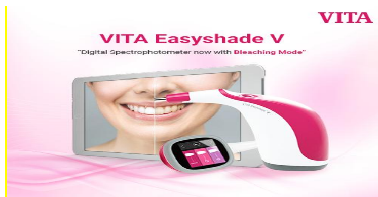
Fig. 6 VITA Easy Shade

These are instruments designed to produce the most accurate color measurements. Spectrophotometers differ from spectroradiometers primarily because they include a stable light source. There are two types of basic designs commonly used for these instruments. The traditional scanning instrument consists of a single photodiode detector that records the amount of light at each wavelength. The light is divided into small wavelength intervals by passing it through a monochromator. A more recent design uses a diode array with a dedicated element for each wavelength. This design allows for the simultaneous integration of all wavelengths. Both designs are considerably slower than filter colorimeters. However, these are the routinely used color-measuring devices. Eg. VITA Easy Shade (Fig.6 ), Crystal Eye 8 . Some other available devices are: Shofu Shade Chroma meter, The Shade T Scan, Shade Rite Dental Vision System, The Spectro Shade.