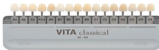
Fig.2 VITA Clascal Shade Guide

VITA Classic (Fig.2): The color space in Vita Classical is divided into four groups – A, B, C and D based on the dominating HUE (name of the color). In group “A” these are red and brown, in group B – red and yellow, in group C – grey and in group D red and grey. Each of the “letter” groups has subdivisions indexed with Arabic number 4 . With the increase of the number, the Chroma increases, while at the same time, the value decreases.