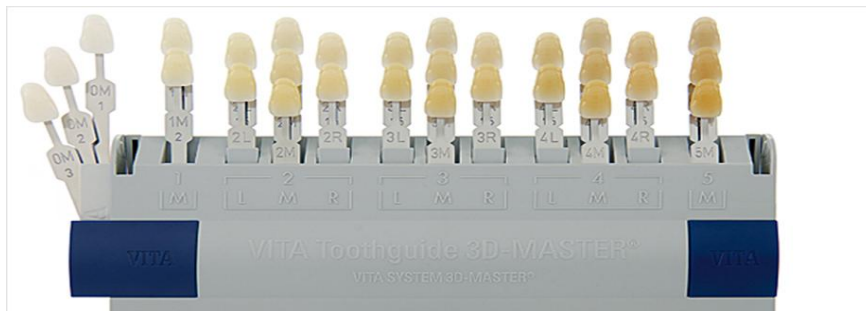
Fig. 3 VITA 3 D Master Shade Guide

Chromascop (Ivoclar Vivadent, Amherst, NY, USA) (Fig.4 ): In this shade guide, the color space is distributed in five groups based on the Hue dimension. The color-coding is as: In group 100 – white, In group 200 – yellow, In group 300 – grey, In group 400 – grey, In group 500 – dark brown