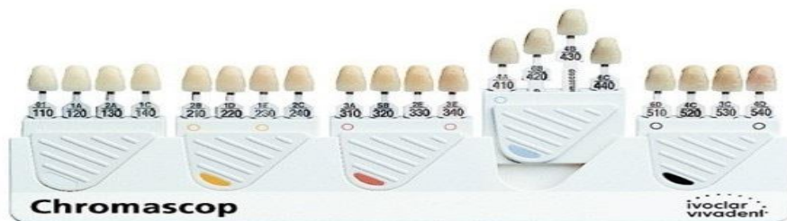
Fig.4 Chromascope Shade Guide

Chromascop (Ivoclar Vivadent, Amherst, NY, USA) (Fig.4 ): In this shade guide, the color space is distributed in five groups based on the Hue dimension. The color-coding is as: In group 100 – white, In group 200 – yellow, In group 300 – grey, In group 400 – grey, In group 500 – dark brown