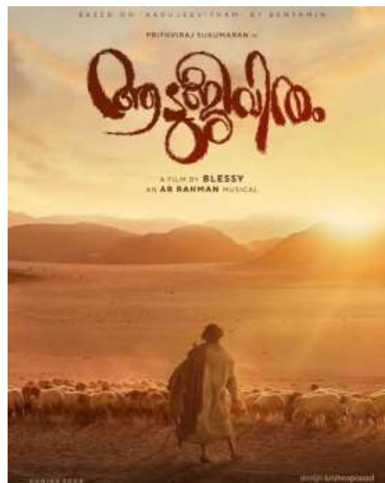
Fig 2. Poster of the movie Adujeevitham