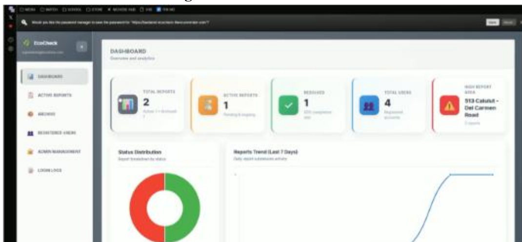
Figure 3: Admin Dashboard

The EcoCheck Admin Dashboard provides barangay officials with a centralized overview of environmental monitoring and waste reporting analytics. It displays key metrics such as total reports, active cases, and resolved reports, alongside a tracker to identify environmental hotspots. The interface also features status distribution charts and submission trends to help LGUs make data-driven decisions and manage case resolutions. It also improves monitoring efficiency and coordination among officials. Additionally, it supports faster response and prioritization of reported environmental concerns. This enables more effective and timely environmental interventions at the barangay level. It also strengthens transparency in tracking environmental compliance and response actions.