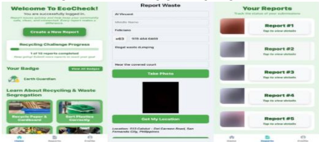
Figure 2: EcoCheck Homepage and Reporting Features

EcoCheck provides a secure experience by requiring account registration and email verification, ensuring only verified residents can access the platform. The homepage serves as the main hub, allowing users to monitor their participation through a progress tracker and access educational modules on waste segregation. Through the report waste interface, residents can capture photographic evidence and automatically tag precise geo-locations, while the tracking screen provides real-time updates on the status of their submissions to ensure LGU accountability.