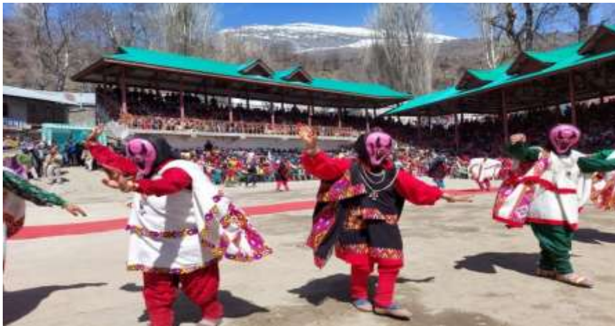
Fig 2: Traditional masked dance performance during a community festival in Pangni valley.

The Pangwal community also celebrates festivals such as Sair, Jukaru, Dussehra, Diwali, and Shivratri with great enthusiasm. Sair is associated with the agricultural cycle and seasonal change, while Jukaru is celebrated to strengthen social harmony and brotherhood within the community. Dussehra and Diwali reflect the influence of Hindu traditions in the region, whereas Shivratri is observed with devotion to Lord Shiva, who holds an important place in local religious beliefs. These festivals continue to play a significant role in preserving the traditional identity and cultural continuity of the Pangwal tribe.