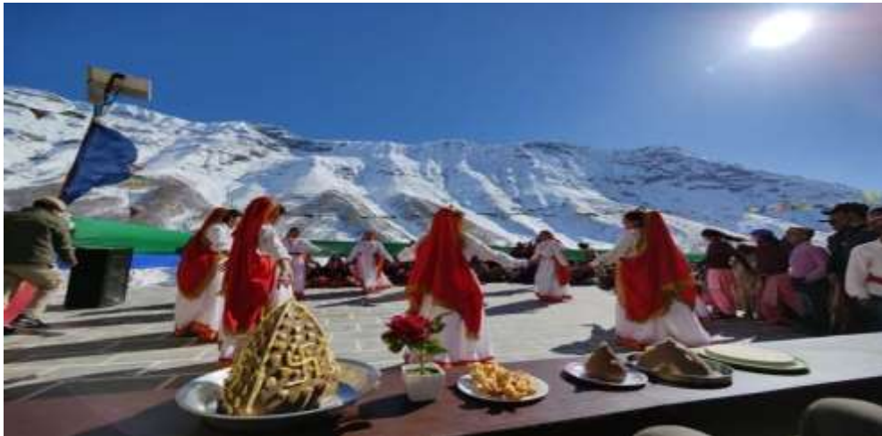
Fig 1: Pangwal women performing a traditional folk dance during a gathering.

Religion 1 and spirituality have played an important role in shaping the cultural life of the Pangwal tribe. The community traditionally follows nature-based beliefs and considers mountains, rivers, forests, and natural forces sacred. Their religious practices reflect a close relationship with the natural environment. Over time, Hinduism also influenced the community, particularly the worship of deities associated with the Shiva and Shakti traditions. Local gods and village deities continue to hold an important place in the religious and social life of the Pangwal people.