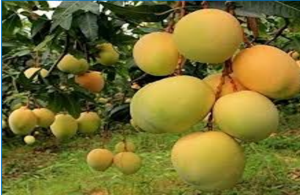
Dapoli – Ladghar Mango