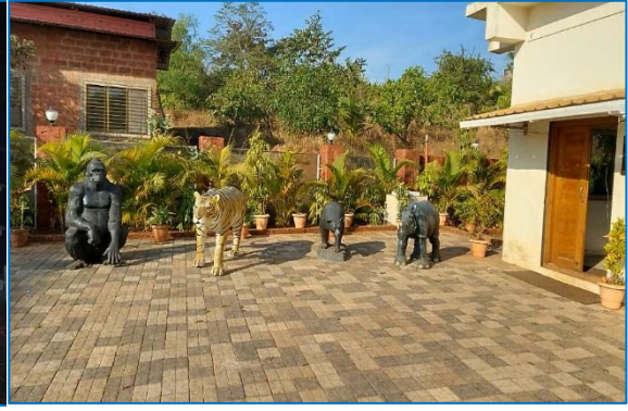
Hotel Volga Residency