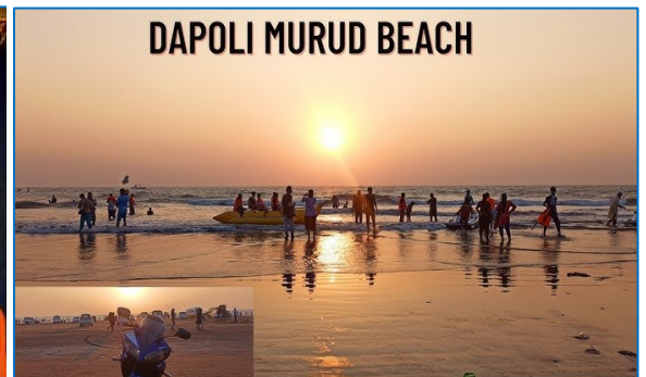
Murud Beach - Senset