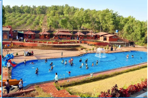
Water Park Gavtale