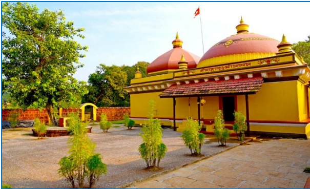
Kadyavarcha Ganpati, Anjarle