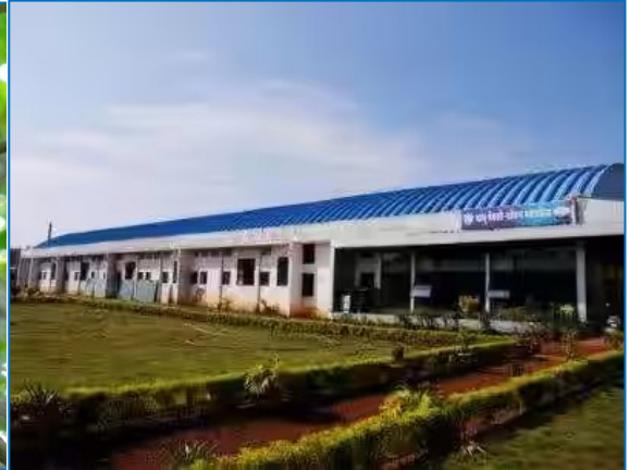
Kokan Falprakriya, Valne