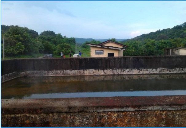
Unhavare Hot Water Kund