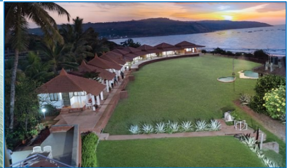
Ladghar Sea & Resort