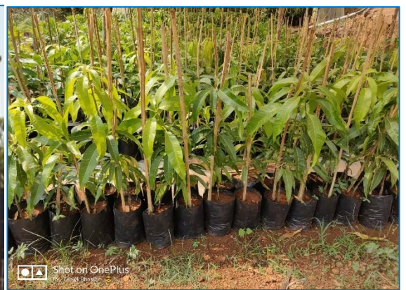
Kokan Krishi Vidyapeeth, Nursery