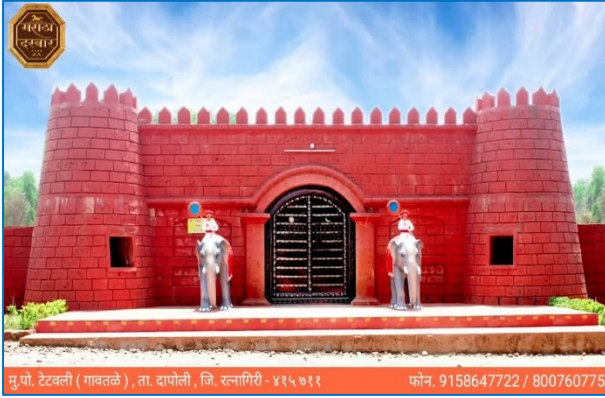
Water Park Gate, Gavtale