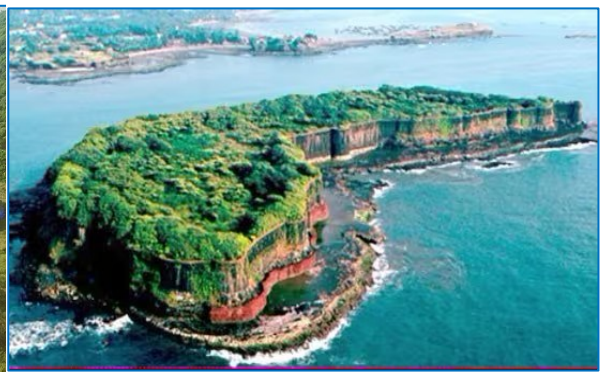
Suvarnadurga Port, Harnai