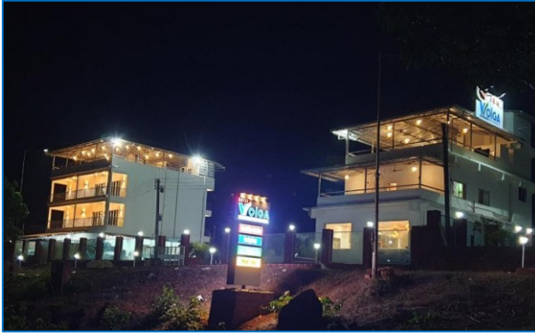
Hotel Volga Residency