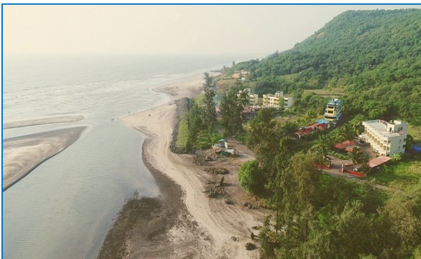
Harnai – Kelshi Sea View