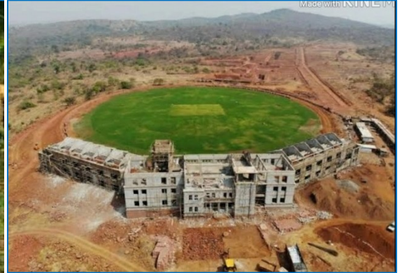
Dapoli – Waghave Stadium