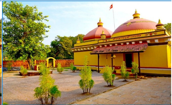
Kadyavarcha Shiv Mandir, Anjarle