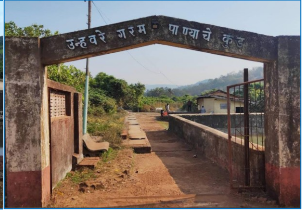
Unhavare Hot Water Village