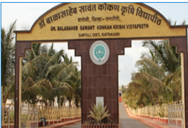
Dr. B.S. Kokan Krishi Vidyapeeth Dapoli