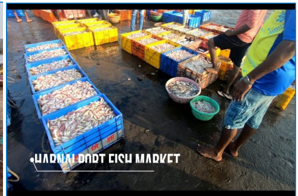
Harnai Port - Fish