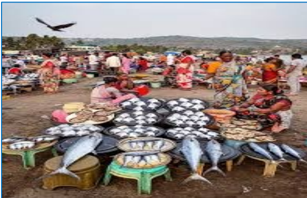
Harnai Port - Fish